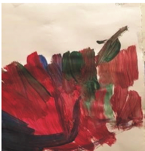
Mozart, W.A. A Little Night Music 1

Procedure: Children sit in the classroom, dressed in protective coats, on the desks they have a mat with paper drawings, paintbrushes and tempera. Music sounds in 4-5 minute intervals. Children respond to background music by their spontaneous painting. First they applied paint to paintbrush, fingers, palms, or a piece of cloth. It is up to them what they use, and subsequently apply to paper drawing (each sample separately) – see fig. 1.