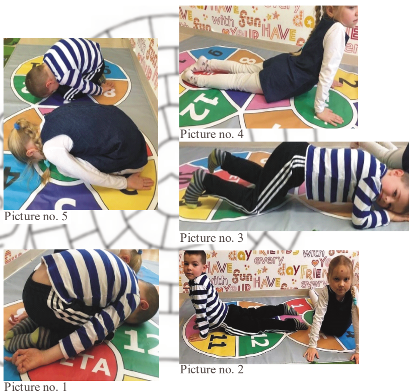
Fig. 2. Curious Snail

Variation: Children can improvise, create their own composition, focusing for example on a tired snail, who is getting ready for bed.