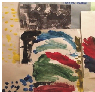
Mozart, W.A. A Little Night Music 1