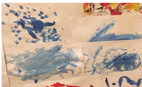
Frozen Let I go 1