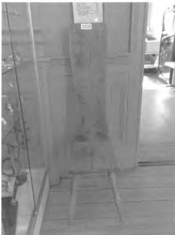
FIG. 3. Allvar Gullstrand's diagnostic chair, now at the Museum for History of medicine, Uppsala (Sweden), www.medicinhistoriskamuseet.uu.se

Gullstrand's theory of physiological optics. Gullstrand applied the methods of physical mathematics to optical images and to the refraction of light in the eye; he was recognized for making the most significant contribution to our understanding of the eye as a refractive organ. Gullstrand investigated also in the mechanism of accommodation; by his research he observed the intracapsular motion of the lens substance during accommodation. Based on his doctoral thesis on astigmatism and on Helmholtz's theories Gullstrand developed his theory of physiological optics. The complete proof of this theory is found in the following three works: Allgemeine Theorie der monochromatischen Aberrationen und ihre nächsten Ergebnisse für die Ophthalmologie (General theory of monochromatic aberrations and their immediate significance for ophthalmology) (1900), which received awards from the Swedish Royal Academy of Sciences and the Swedish Medical Association, Die reelle