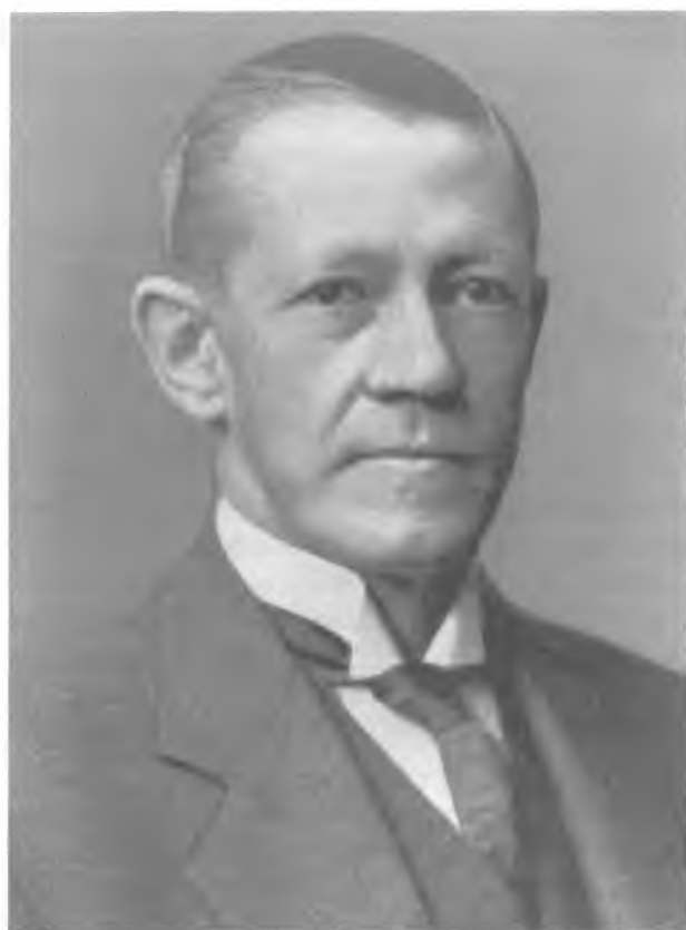
FIG. 1. Prof. Allvar Gullstrand

the methods of physical mathematics to optical images and to the refraction of light in the eye. For his work, he received numerous awards, most important the Nobel Prize in Physiology or Medicine in 1911 1 .