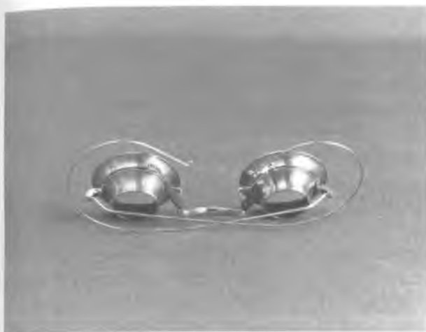
FIG. 6. Gullstrand's Katral glasses

Gullstrand's glasses. These glasses, which still carry the name of this great ophthalmologist, are point by point projecting glasses ("Katral Glasses"), which were used for aphacic eyes after cataract surgery. These glasses reduced a set of aberrations. As Gullstrand was an excellent mathematician and having good contacts to Zeiss it was able for him to construct the curvatures in lenses which he had calculated. He originated the punctual lens, the Katral lens and aspherical lenses for illumination 11 .