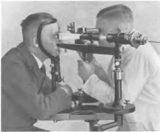
FIG. 4. Examination using nitra slit lamp according to Gullstrand

Beside of all theoretical achievements Gullstrand also invented several instruments which, as mile stones in ophthalmic diagnosis, were and still are highly valuable to ophthalmologists. As Gullstrand contributed numerous achievements to ophthalmology only a selection is shown below to demonstrate his important influence on science, valid even today.