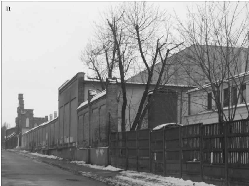
Fig. 2. Good and bad practices of fitting new investment into post-industrial areas in Łódź Special Economic Zone – Textorial Park (A) and Dakri Ltd. (B).