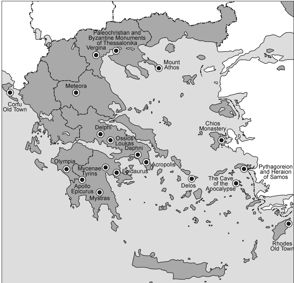
Fig. 1. The UNESCO sites of Greece