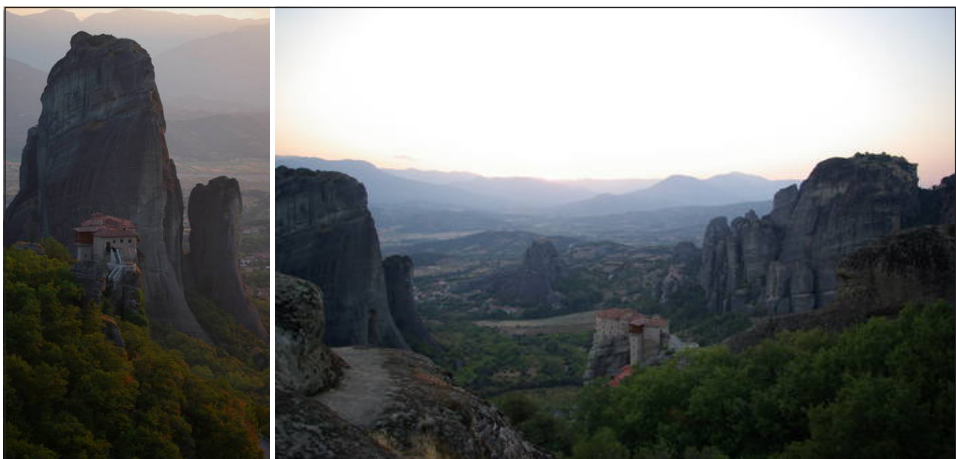
Fig. 4. The geological formations of Meteora (mixed UNESCO site)

Indeed, efforts made even by the first Urban Plan ensured that extension of Kalambaka city would take place on the opposite side of the monument area, as well as that building densities in the districts found in the proximity of the monument would remain lower than those in other parts of the city. Initial Urban Plan however, regulated only the strict area of the city of Kalambaka. That means that for a long time rural space and natural areas in the surroundings were left without planning regulations; therefore building activity in many cases proved a negative factor for the monument and its landscape. At the same time, urban regulations failed to protect architectural features of Kalambaka city, which is considered to be the reception pole and the gate towards the UNESCO site.