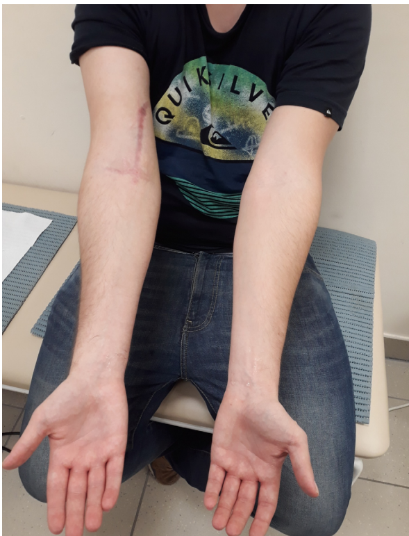
Fig. 3. Condition after last control visit

Warming and blood supply to the right upper limb normal. The pulse was well felt on the radial and ulnar arteries. Active finger movements and sensation preserved. The patient had a fixation brace on. The patient was discharged with the wound during normal healing. The patient reported for control- 7 days, 1 month, 3 months, 6 months after discharge from the hospital. The patient had sutures removed on the 12th day after surgery, the splint was removed a month after leaving the hospital. During follow-up examinations, the blood supply did not deteriorate, the feeling of numbness in the fingers of the right hand subsided. Contracture in the elbow and the weakness of the right arm muscle lasted for a long time. However, thanks to the implemented rehabilitation, the range of motion in the elbow and the degree of muscle strength improved significantly. Fore-arm swelling persisted for up to 3 months after the procedure, then gradually subsided. The patient currently leads a normal life using the upper right limb to the full extent without any restrictions (Figure 3).