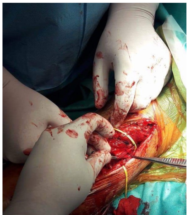
Fig. 2. Just before removing the vascular clamp to activate flow through the brachial bridge

The course of postoperative treatment without major complications. At first, the patient felt only numbness of the fingers and slight swelling of the forearm.