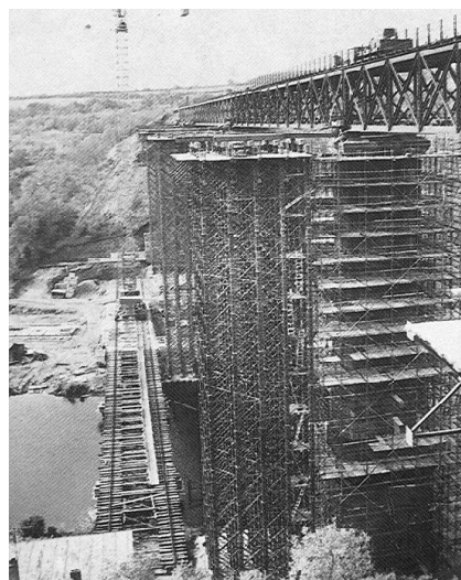
Picture 2. Bridge across the river Dyje at Znojmo - bridge construction ŽM 16 and pillar construction PIŽMO