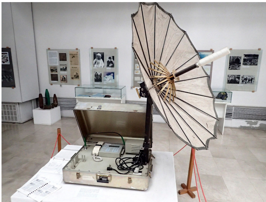
Fig. 3. The “Besieged Sarajevo” exhibition.

to an epistemological level, thus frames the traumatic event in cosmopolitan and universal terms as an attack on civilization and humanity by evil forces opposing it, as is typical of many memory museums (Andermann & Simine, 2012; Violi, 2012). As several scholars have asserted (Andermann & Simine, 2012, p. 8; von Hantelmann, 2014; Hobuß, 2011, p. 3; Violi, 2012, p. 70), it runs the risk of historically decontextualizing the traumatic event, as will be elaborated upon later in this paper.