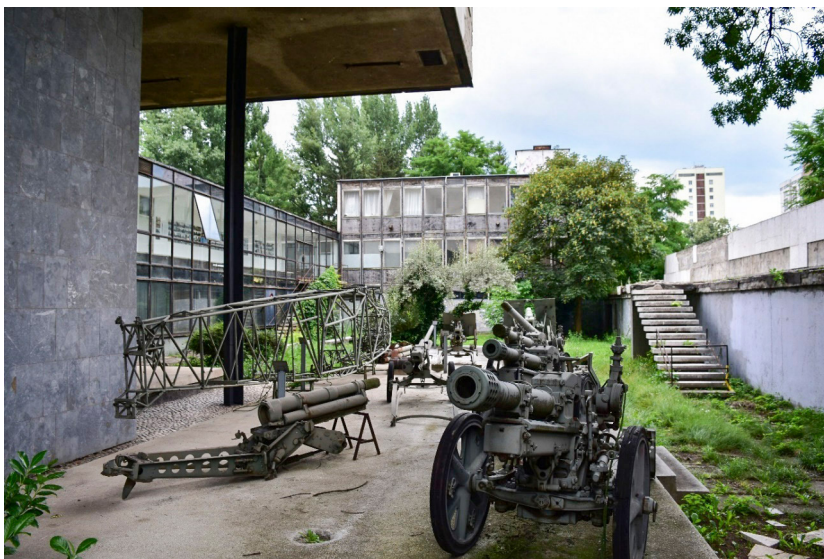
Fig. 2. The museum courtyard.

The Socialist legacy is most visible in the exterior parts of the museum, which still exhibit Socialist-era tanks, arms and other military equipment as well as Tito's statue (fig. 2). The popular and lively Tito Café located in the museum building explicitly works with Yugonostalgic sentiments, and though not directly connected to the museum it interestingly frames its overall perception. The emotional impact of the museum building, which in itself is a historic site and exhibit, is also clearly reflected in the popularity of its aesthetics on social media, particularly on Instagram (Harrington, Dimitrijević, & Salama, 2018; Location: History Museum of Bosnia and Herzegovina, n.d.).