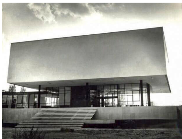
Fig. 1. The museum building, 1963

The museum, which was established earlier but opened in the current location in 1963, is located in one of the most representative modernist buildings of former Yugoslavia and was designed by the architects Boris Magaš, Edo Šmihem and Radovan Horvat specifically for the purpose of the museum (fig. 1.). It starts from an elevated plateau with what once used to be a transparent, light ground floor “that gives a ‘floating’ look to the main body of the building – the cube” (Kreševljaković, 2016, p. 123). During the war, the museum suffered severe damage due to its proximity to the front line. Even today, it shows traces of the war and its subsequent years of financial struggle for survival. Harrington, Dimitrijevic and Salama (2017, p. 180) nicely capture its current state by noting that “all speaks of neglect. The weary body of the building is bitten by rain and frost, and its once-sharp edges and smooth volumes are deformed”.