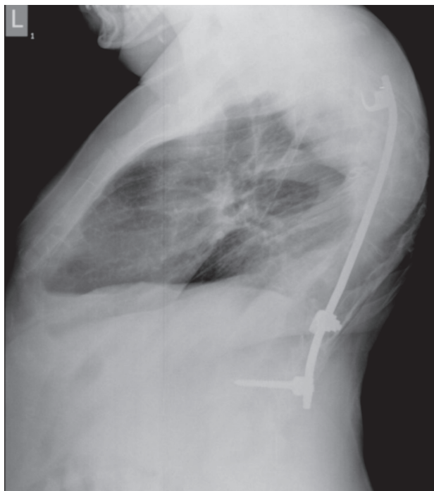
Figure 3. Chest X-ray in left lateral projection: in addition to the deformation and the implant, the correct lung hilum and the normal lung parenchyma are visible

In view of the abnormal gasometry the patient with suspected hypoventilation was referred for further diagnostics to the Pulmonology Clinic. At the Clinic, the patient underwent further diagnostics, i.e., comprehensive blood panel testing, appropriate lung function tests and polysomnography with capnography and arterial blood gas monitoring during sleep, as well as echocardiography.