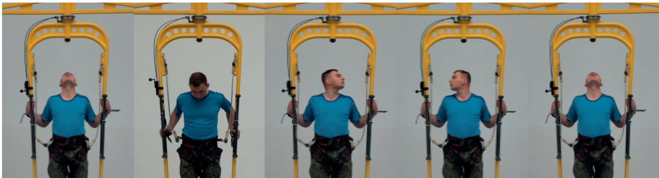
Figure 1. Test on the unlocked looping, taking into account the head movement direction

Examination I – before the preparation period; II – after the preparation period.