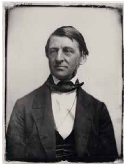
10. Albert Sands Southworth and Josiah Johnson Hawes, Ralph Waldo Emerson , 1857, daguerreotype, 23.2 x 30.9 cm, Historic New England (current whereabouts unknown)

like that of the photographic camera. 43 Nathaniel Hawthorne further developed Emerson's idea of the viewer's participation in the work of art in The Marble Faun , his 1859 novel about the visual arts: