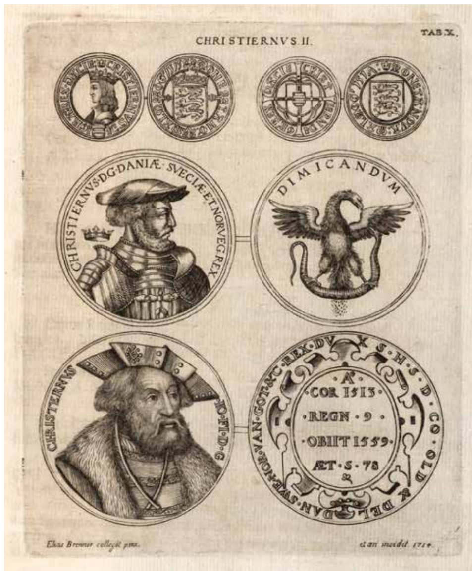
5. Erich Reitz, Willem Swidde (?), Elias Brenner, Thesaurus nummorum sueo-gothicorum [...] 1731, tab X, engraving, alvin:record: 175815, UUB