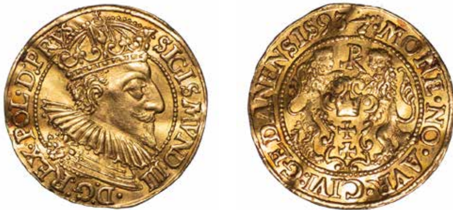
10. Sigismund III of Vasa, 1 ducat 1593, gold, 22 mm, 3,50 g, ID:2567, alvin-record: 353484, UUC

was minted shortly before Sigismund III, who in addition to being King of Poland, also was crowned King of Sweden. The coin measures about 22 mm in diameter, a size which would require the beholder to lay it in their palm or secure it with thumb and index finger to turn it and scrutinise its surface and identify the image stamped into the metal. The obverse depicts the king seen from the right (ill. 10). 61 He wears a crown, a ruff, and a cuirass adorned with a lion's head on his shoulder. His portrait is encircled by the inscription SIGISMVND.III.D:G:REX.POL.D:PRVS. [Sigismund III, by God's grace king of Poland and Prussia]. The reverse shows the coat of arms of the city of Gdańsk, a crown above two crosses supported by two lions. Between the lions' heads, one can spot the chi rho symbol \text{P} . The legend reads MONE.NO.AVR. CIVI:GEDANENSIS93. [new gold coin minted by the city of Gdańsk]. The coin and Sigismund III, who once minted it, might spark a conversation about long-gone political affairs and fierce conflicts, and perhaps even inspire discussions about religion, as Sigismund III's Catholic confession was used as a main argument by Karl IX to undermine his nephews' suitability to rule Lutheran Sweden. 62 It is, of course, impossible to know how Ehrenpreus handled his collection and conversed about it with his guests, but it remains without a doubt that the rich context surrounding the numismatic objects invited social interaction.