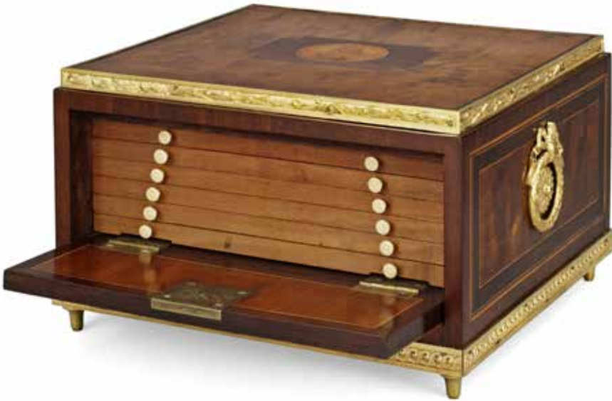
4. Georg Haupt, medal cabinet, 1780, birch, amaranth, boxwood and gilded brass, 30.5 x 28.5 x 18.5 cm, Lot. 800, 90001, Bukowskis

Ehrenpreus's cabinet was very grand and required a designated space. Coin cabinets could also come in smaller, more convenient sizes, like the one gifted to the Duke of Oldenburg, Peter I (1719–1829), by his cousin, the