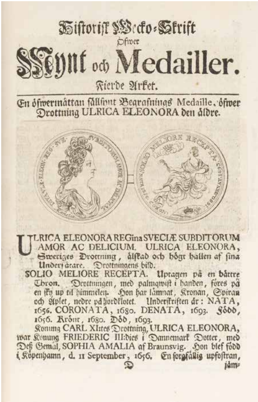
7. Evald Ziervogel, Trettio historiska afhandlingar [...] fierde arket , printed by L.L. Grefing 1755, alvin-record: 176704, UUB