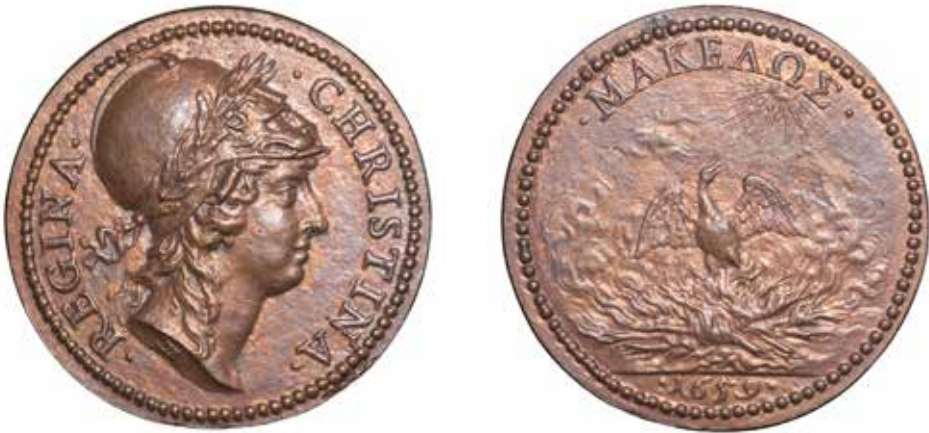
8. Alberto Hamerani, Christina as Phoenix , 1659, cast bronze, \varnothing 41.98 mm, 32.11 g, Hd. 103, inv. 201657, alvin-record: 76490, UUC