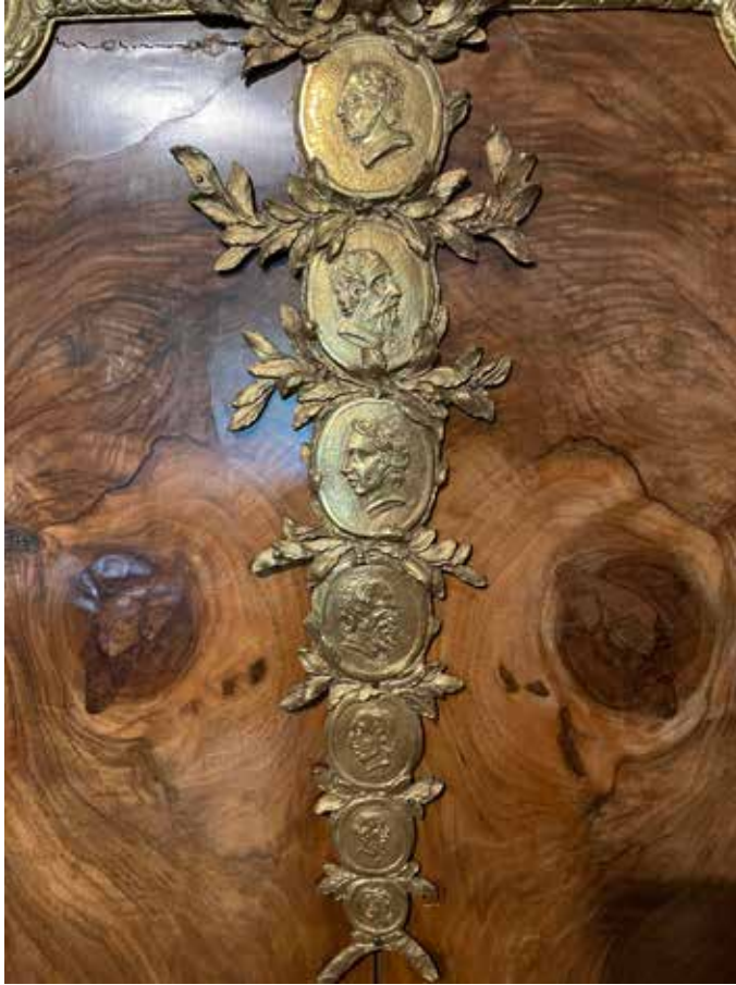
3. Detail of the upper cabinet door, UGCC

had carved-out holes to hold coins and medals. The holes would prevent the objects from scraping against each other and rattling around while the drawer was being opened or closed. Another reason was to organise the cabinet's contents. The insides of each drawer could be arranged in whatever way suited the collector; by regents, chronological, geographical, by type of currency, or even by metal. Susan Pearce notes that objects in a collection are entwined in relationships with each other. 41 Each coin or medal could be appraised individually, each had a value and physical characteristic of its own, but it also held a purpose within the collection. It was or would be part of a group. Simply put, by organising the