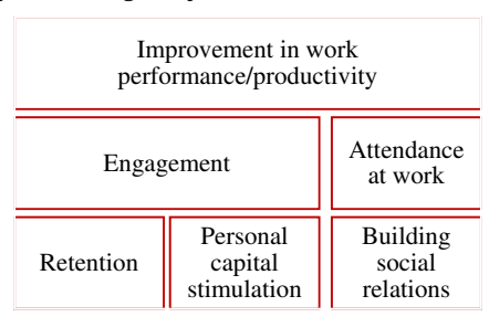
Figure 2 Employee wellbeing benefits

Source : authors' elaboration based on "The measurement of employee wellbeing: Development and validation of a scale", R. K. Pradhan, & L. Hati, 2019, Global Business Review , 23(2), p. 390 (https://doi.org/10.1177/0972150919859101).