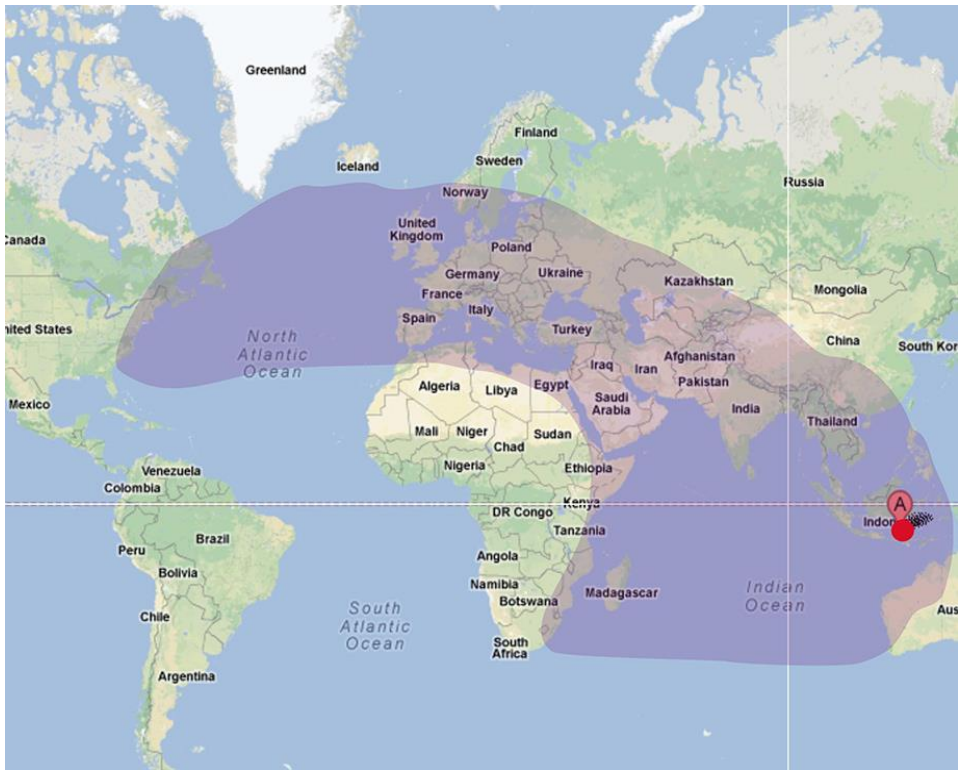
Picture 1. The ash cloud of the Mount Tambora Eruption in 1815