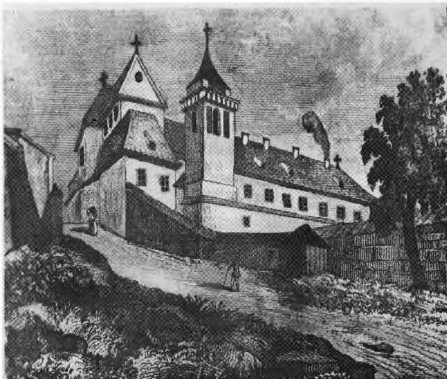
The cloister and the church of St Michael and St. Joseph of the Discalced Carmelites in Krakow. Steel engraving J.W. Linke, XIX century

The early Baroque brick church was built on the plan of a Latin cross, with the façade turned east towards Grodzka Street. The main body had three aisles and a transept. The aisles were reduced to two pairs of side chapels connected with a narrow passageway. The façade of the church had no tower but had two-storeys and three-spans, and was modified according to the style of Il Gesu , in compliance with an accepted model and the regulations of Carmelite architecture 6 .