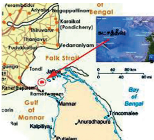
Map 2. Kachchateevu Island between India and Sri Lanka

emerged in the post-independence period of the country. The concept of a Tamil homeland to be carved out of Sri Lankan territory as proposed by the Tamil militant groups was strongly supported and endorsed by the Tamil Nadu politicians. The Liberation Tigers of Tamil Eelam (LTTE) was the major militant organization that engaged in a war with the Sri Lankan government from the 1980s to mid-2009. When Sri Lankan government troops finally defeated the LTTE in 2009, the Tamil Nadu government was very unhappy about it and forced the Indian central government to ally with the USA and pass a resolution on war crimes and human rights violations against the Sri Lankan government at the UNHRC in Geneva. Being under pressure from the Tamil Nadu state government, India voted in favor of the UNHRC resolution against Sri Lanka in 2012 and 2013 (Manoharan, 2013). Tamil Nadu political parties also tend to raise the issue of regaining Katchatheevu Island during their election campaigns in order to gain favor with the fishing community that lives in the coastal areas of Rameshwaram. Since the Rameshwaram fishermen are intent on fishing in the Katchatheevu waters, despite the fact it amounts to poaching, the demand to regain control of the island by the Indian administration is a popular slogan in the internal politics of Tamil Nadu (Thalpawila, 2014). The stand against the