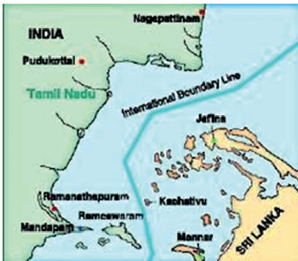
Map 1. International Maritime boundary between Sri Lanka and India in disputed area

like Nepal and Afghanistan are landlocked Sri Lanka and the Maldivian Islands are entirely surrounded by the ocean. Territorial and border issues are common characteristics of most of these countries beginning from the post-colonial era. The reason Sri Lanka has never experienced border conflicts with its neighbors is because being an island it does not have borders with neighboring territories. However, a significant scenario of the post-independent period is that Sri Lanka has been facing a number of maritime issues. These issues mainly pertain to the maritime zone comprising Palk Strait and the Gulf of Mannar, where the maritime borders of India and Sri Lanka lie along a narrow sea belt. This maritime border was drawn and agreed upon by the erstwhile Prime Ministers of India and Sri Lanka, Mrs. Indira Gandhi and Mrs. Sirimavo Bandaranaike who signed an agreement ratifying it in 1974. According to that agreement the India-Sri Lanka maritime boundary was demarcated as commencing in the sea from a point about 18 nautical miles North-West of Point Pedro in Sri Lanka to Adam's Bridge in the Palk Strait, covering a distance of approximately 86 nautical miles (Rathwate, 2014). Again in 1976, both countries entered into a second agreement, according to the terms of which each party received the sovereign rights and jurisdiction covering the continental shelf and Exclusive Economic Zone (EEZ), including the living and non-living