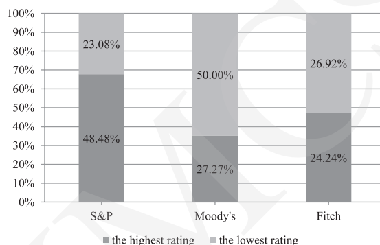
Figure 3. The highest and the lowest rating awarded by agencies

Furthermore, the analysis of the ratings awarded to the issuers by individual agencies was carried out, in order to check which agency gave the highest and the lowest credit ratings. For this purpose, the issuers which received the ratings from two or three agencies were analyzed. The issuers which received the rating only from one agency were excluded from this sample. The analysis does not also include the situations where the assessment of the agencies was the same.