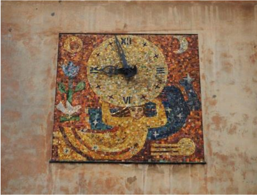
Fig. 1. Warszawa–Mariensztat, Mosaic Clock , Zofia Czarnocka-Kowalska, Jan Seweryn Sokółowski, 1948.