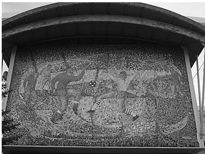
Fig. 17. Chorzów, Silesian Stadium , Henryk Kobyliński, Henryk Holecki, 1970. Photo by Bożena Kostuch, 2016.