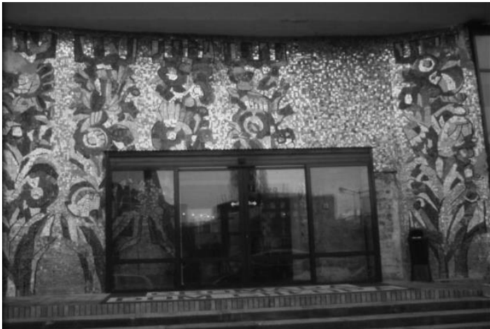
Fig. 3. Warszawa, Dom Chłopa Hotel , Władysław Zych, 1961. Photo by Marek Czapelski, 2000.

Another mosaic, executed by Władysław Zych (see fig. 3) is not preserved: “This mosaic (with the motif) of huge, stylized Kielce Easter “palms” on a gilded background, set in the entrance at a specific angle, makes a magnificent luminous effect at sunset. It is clearly visible from afar.