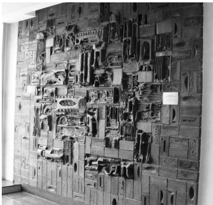
Fig. 4. Poznań, Merkury Hotel , Andrzej Matuszewski, 1963.

Other outstanding examples of hotel decorations are those in hotels “ Merkury ”, Poznań (see fig. 4) and “ Cracovia ” in Cracow. Poznań was