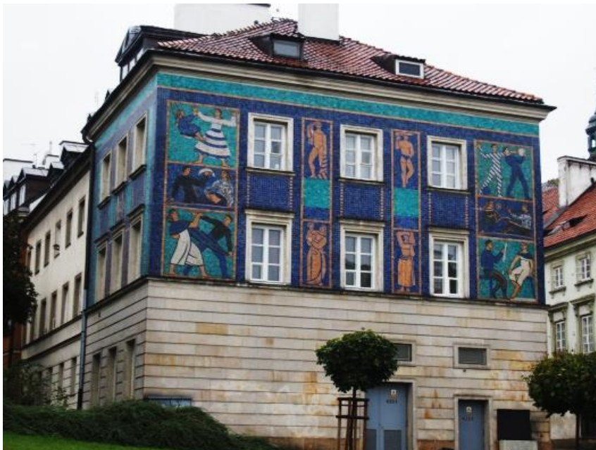
Fig. 2. Warszawa–Nowe Miasto, House at Mostowa Street , Zofia Czarnocka-Kowalska, 1956. Photo by Bożena Kostuch, 2016.