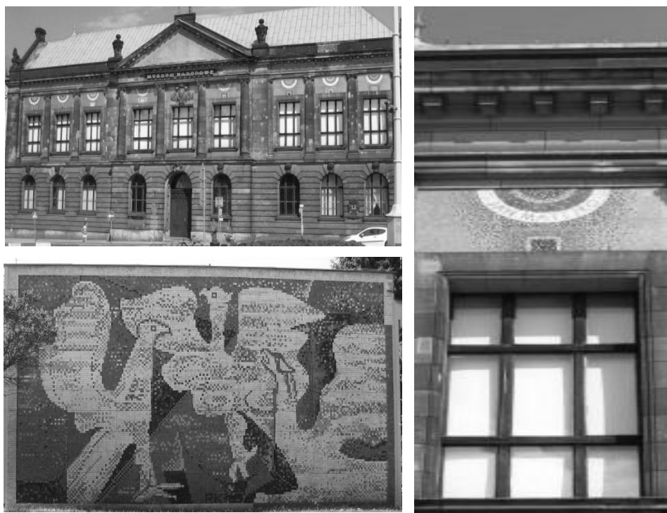
Fig. 13, 14. Left , Poznań, National Museum in Poznan (façade), Zbigniew Bednarowicz, Włodzimierz Dudkowiak, 1976. Photo by Jarosław Mulczyński, 2016; Góra Św. Anny, Muzeum Czynu Powstańczego , Ryszard Kowal, 1980. Photo by Witold Iwaszkiewicz, 2016.

In 1976 nine mosaics designed and created by Zbigniew Bednarowicz in cooperation with Włodzimierz Dudkowiak, were installed in the upper part of the façade of the National Museum in Poznań (see fig. 13, 14). They are