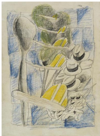
Il. 2. Henryk Streg (Marek Włodarski), Rysunek z kapeluszami , 1930, ołówek, kredka, gwasz, papier, 26,5 x 19,5 cm, Muzeum Sztuki w Łodzi.