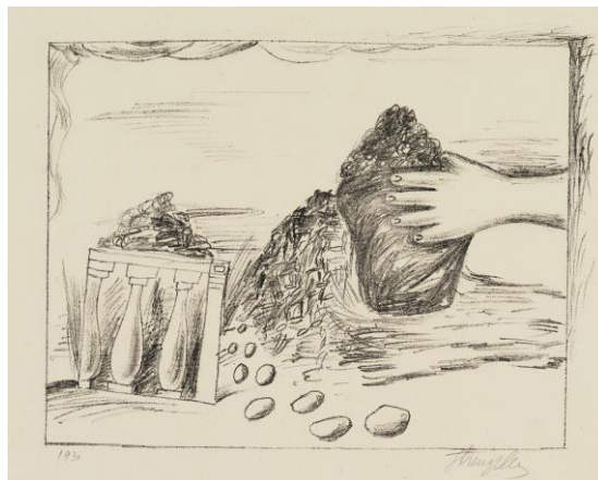
Il. 3. Henryk Streg (Marek Włodarski), Sen , 1930, farba graficzna, papier, 24 x 30 cm, I TeKa Graficzna Zrzeszenia Artystów Plastyków Artes, Muzeum Sztuki w Łodzi.