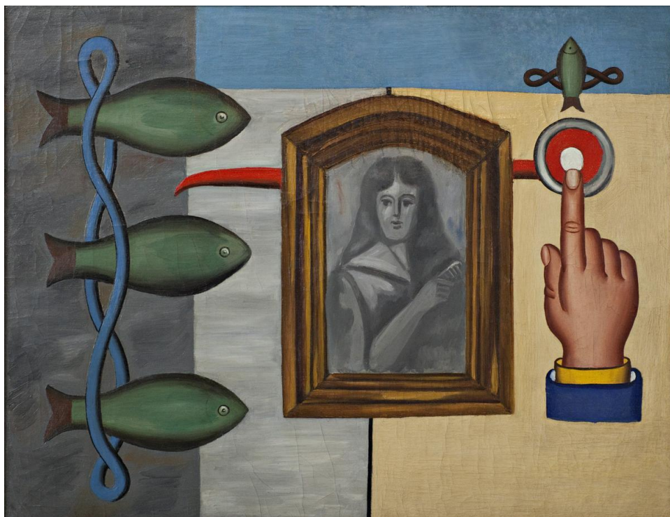
Il. 1. Henryk Streg (Marek Włodarski), Ryby i portret , 1930, olej, płótno, 65 x 82 cm, Muzeum Sztuki w Łodzi.