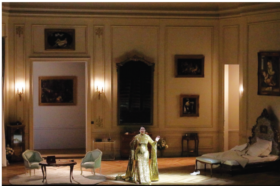
Photo 2. Maria Callas dies of a broken heart from 7 Deaths of Maria Callas .

in a kind of tableau vivant , typical gestures and mimics of Maria Callas (Photo 2). In the end what remains is Maria Callas' body as a symbol – here, present, or even re-incarnated in Marina Abramović's body – and, most of all, in her voice.