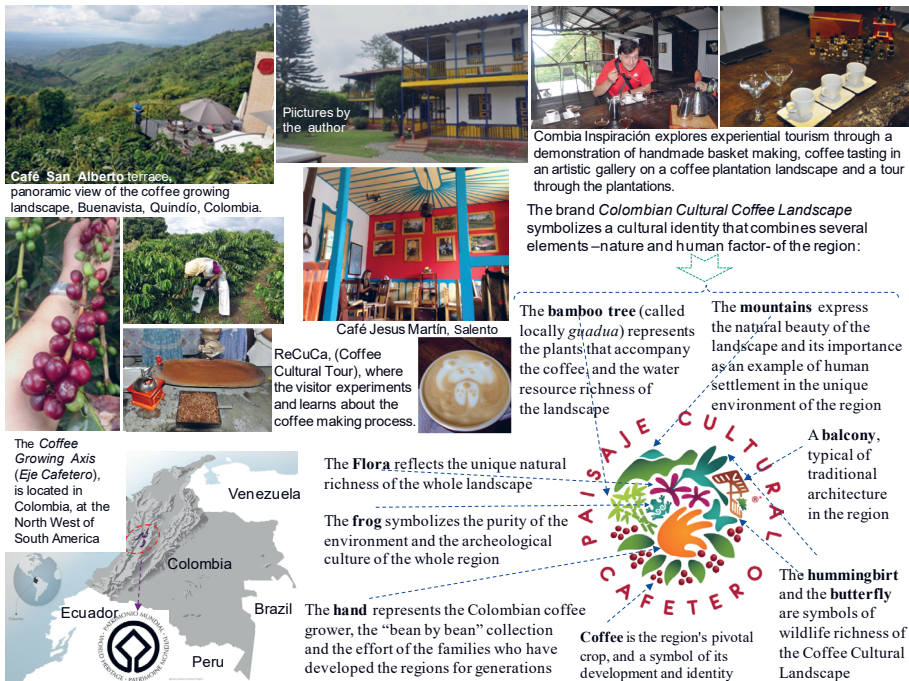
Figure 2. Experiential tourism, in search of authenticity in the Colombian Coffee Cultural Landscape.