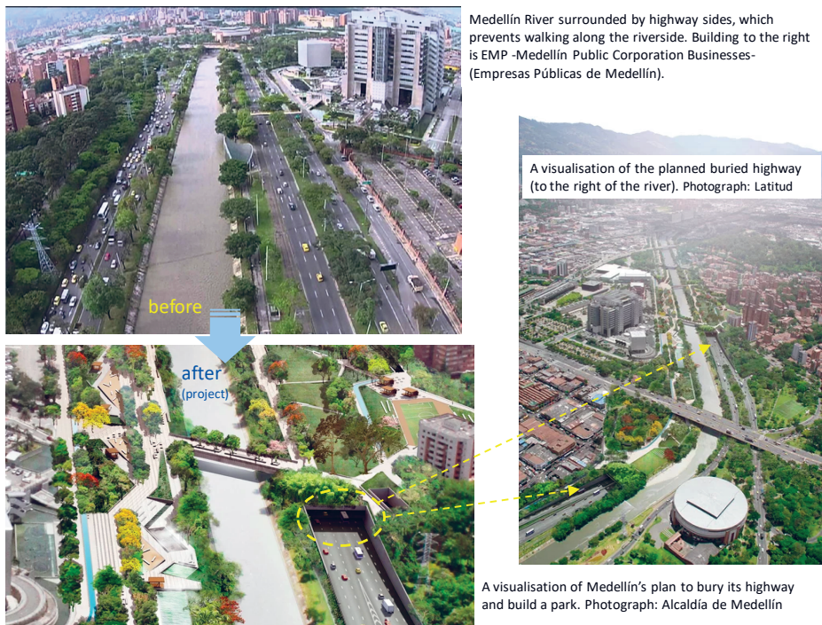
Figure 4. Plan to bury a stretch of highway along the Medellín River, to provide green space for citizens' leisure.

Due to this transformation, in 2016, Medellín received the Lee Kuan Yew Award, an award which is considered to be the Nobel Prize of Urbanism, and which is awarded biannually by the Urban Redevelopment Authority Singapore and the Centre for Liveable Cities to promote urban innovation and sustainable development. Since 2010, the award bears the name of Lee Kuan Yew (1923–2015) who was the Prime Minister of Singapore and globally positioned this city-state. 38 other cities from around the world competed; among them, those that received an honorary award were Auckland (New Zealand), Sidney (Australia), Toronto (Canada) and Vienna (Austria).