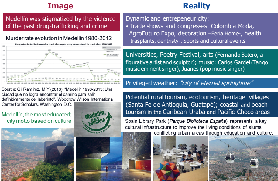
Figure 3. Differences between the image and reality of Medellín, from the beginning to the end of the 1990s and 2000.

Because there was a big difference between the city image and its reality