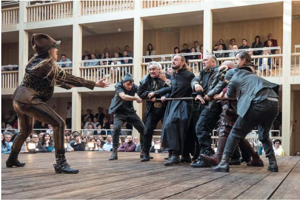
Fig. 1.

The audience was able to admire these beautiful costumes up close largely thanks to the new stage layout. For the first time since the theatre's opening we were able to witness the malleability and full potential of its movable stage. Abandoning the classical setup for the thrust stage of Shakespeare's times was the key to the production's overall look and tone as well as its acting style and stage movement. Not only did the standing audience have access to the stage from three sides, allowing them an unprecedented proximity to the actors from multiple perspectives, but also they had the chance to literally mingle with them as the performers often joined "the groundlings," addressed them directly, threw items of clothing at them, or simply asked for a light. Such lively interaction together with the actors' unhindered movement, which often extended from the acting area into the auditorium, were the main driving force behind the show and defined it throughout by the performers' vitality, rule-breaking and anarchic spirit.