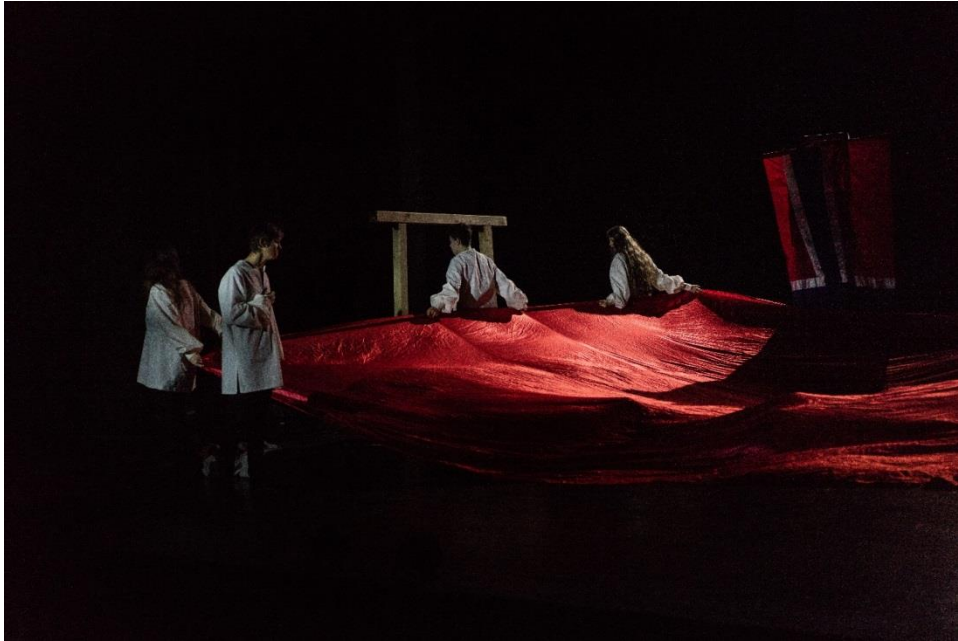
Figure 1. Hamlet (2018), directed by Dana Trifan Enache: final scene