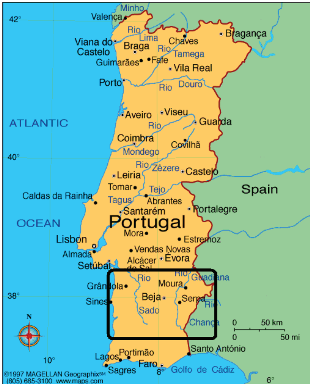
Figure 2. The territory under the direct influence of the IPBeja

The Polytechnic Institute of Beja (IPBeja) is located in Beja, the capital of Baixo Alentejo region and has as direct influence in the geographical areas called Baixo Alentejo and Alentejo Litoral. The IPBeja is the only public HEI in the region.