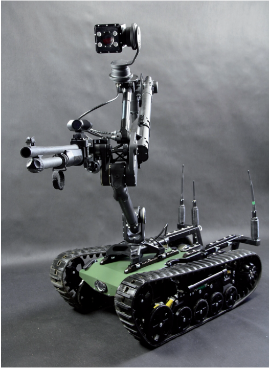
Photo 1. Modern Piap Patrol robot used to detect CBRN threats

Source: Nowy robot mobilny PIAP PATROL ®, https://piap.pl/2020/05/19/nowy-robot-mobilny-piap-patrol/ (access: 02.12.2021).