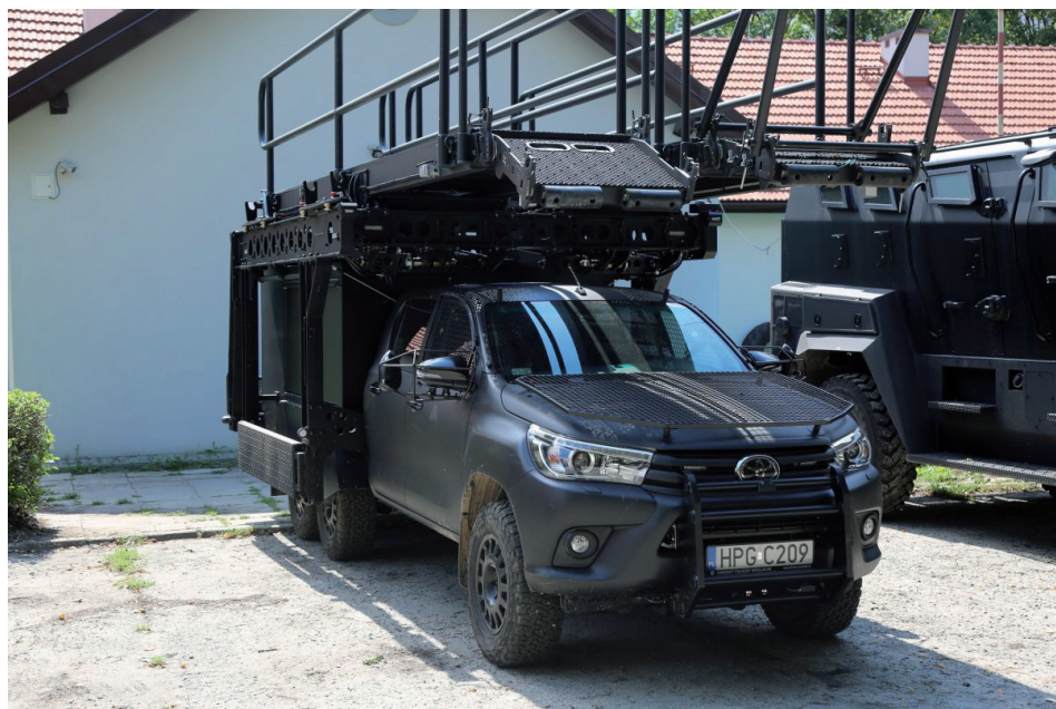
Photo 2. Assault platform based on the Toyota Hilum car - front view

Another example of the use of specialized equipment may be the vehicle purchased for the needs of the Małopolska Police Department. It is a modern pickup truck based on a Toyota Hilux 6×6 car, subjected to deep modifications. The vehicle has an assault ramp with two independently raised gangways. These types of ramps have previously been delivered, among others to JW Grom [Military Unit ‘Thunder’]. At the rear of each gangway, there are raised integrated ballistic shields. During the assault, up to eight operators can be on the ramp. A container for transporting assault equipment is located under the ramp. Two officers can move in the cabin of the vehicle, behind the front seats there is a technical compartment with communication, signaling, etc. devices and a separate space for individual equipment.