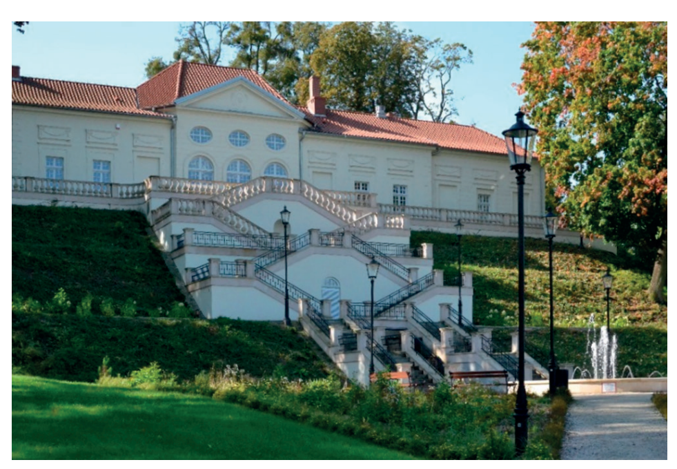
Photo 2. Orangery of Culture in Lidzbark Warmiński