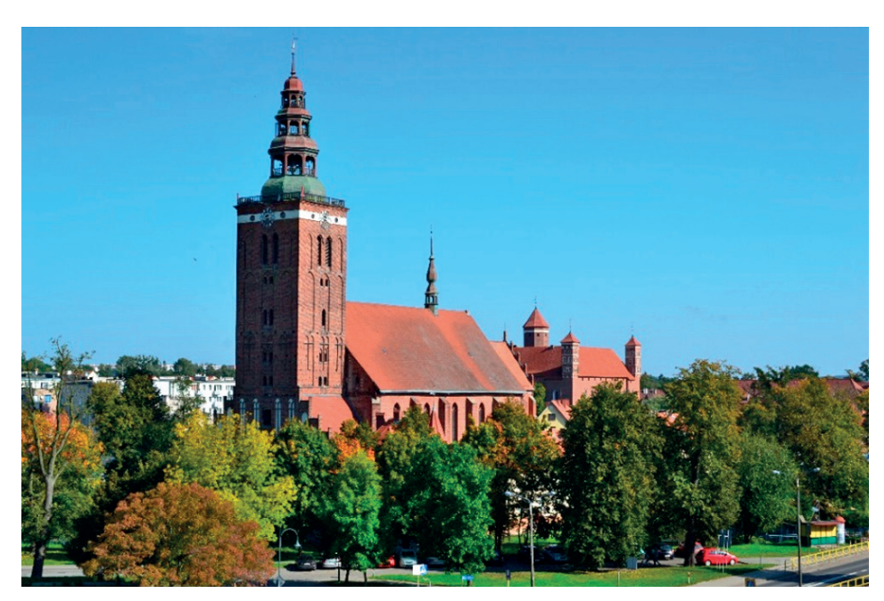
Photo 1. Collegiate Church of the Saint Peter and Paul Apostles in Lidzbark Warmiński

Cities belonging to the Polish National Cittaslow Network have many cultural heritage resources, which are typical of Warmia and Mazury Region. For example, in Lidzbark Warmiński, which is one of the first Cittaslow towns in the region, these are Collegiate Church of Saints Peter and Paul Apostles (Photo 1) or Orangery of Culture (Photo 2), in Bartoszyce, which is one of the largest Cittaslow towns – The Old Town (Photo 3) with Lidzbark's Gate (Photo 4).