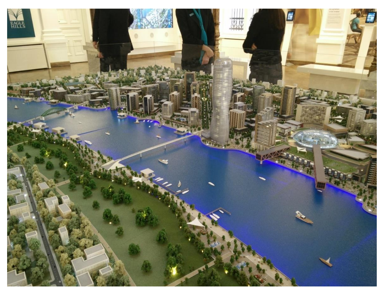
Figure 1. The first maquette of BW exposed to the public (2015).

Another aspect of state narratives refers to the return of Serbia to the world concert of nations. During his presidency of the Socialist Federal Republic of Yugoslavia, Marshall Tito was primarily portrayed as a 'Citizen of the World' instead of a 'regional leader', which had an indirect influence on both the self-understanding and self-respect and pride of the Yugoslavs (Tournois & Derić 2021). Since the dissolution of Yugoslavia and the wars that followed, Serbian citizens fell again in the negative imagination associated with the Balkans: "one of the West's most significant others" and, along with South American drug cartels and the predatorial Japanese economy, the region was represented as the 'civilizational antitype' (Hammond, 2005, p. 135).