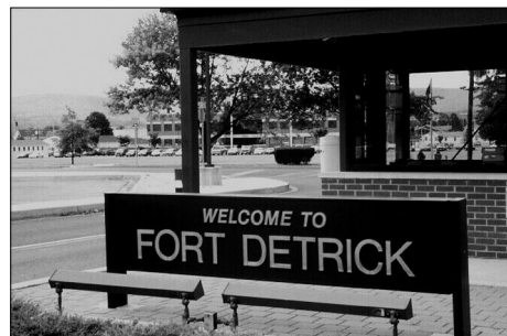
Fig. 4. Entrance to Fort Detrick with Maryland headquarters building in background.

The US program expanded during the Korean War (1950-1953) with the establishment of a new production facility in Pine Bluff, Arkansas and by the late 1960s, the US military had developed a biological arsenal. At Fort Detrick, biological munitions were detonated