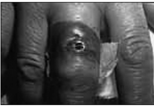
Fig. 9. Cutaneous anthrax on the finger of a veterinarian who contracted condition through animal exposure