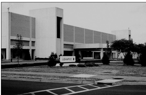
Fig. 3. Front of main building at USAMRIID on the grounds of Fort Detrick.