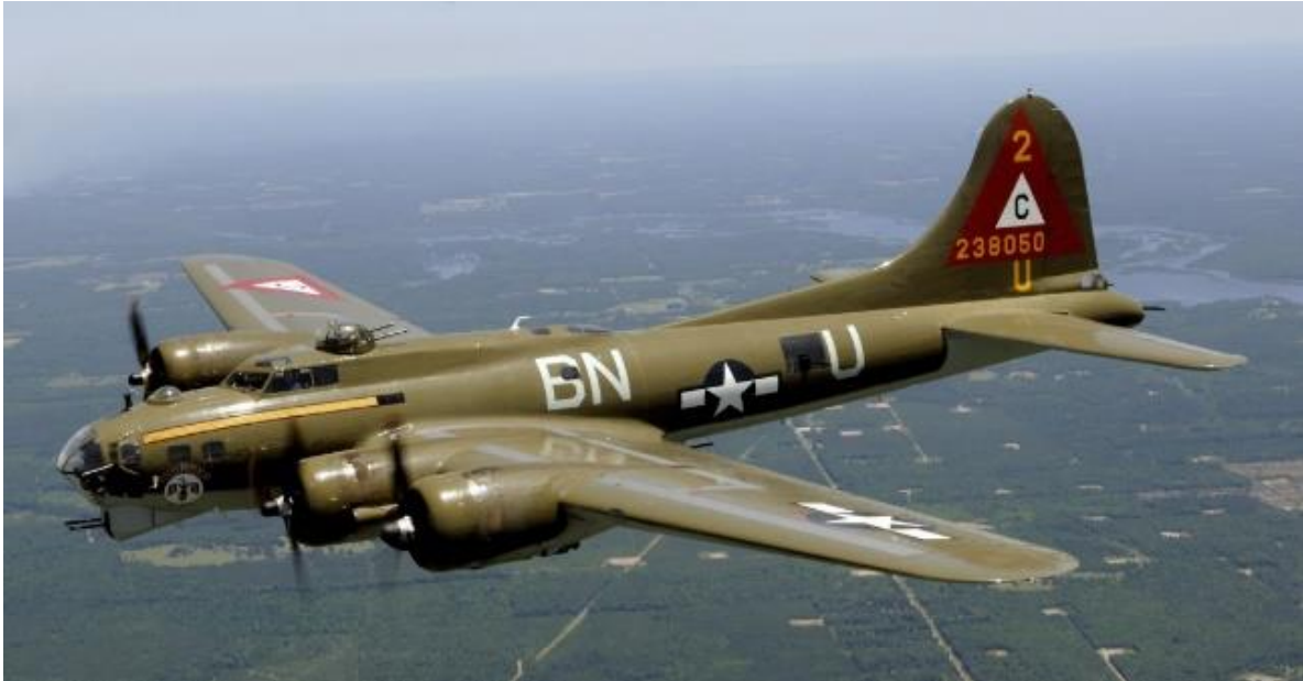
Figure 2 Bomber from World War II, Ike-battered Lone Star Flight Museum moving inland by H. Alexander, H. Chronicle, 2014, (pinrrest.com.).

The end of World War II marks the appearance of the first jet aircraft Messerschmitt Me 262 Schwalbe fighter-bombing aircraft (Swallow)( Fig.5).