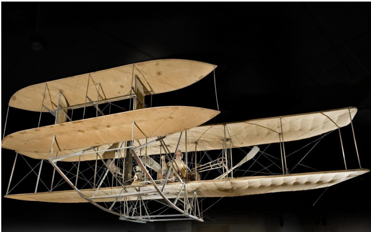
Figure 1 The Wright 'brothers' glider 1909 Wright Military Flyer, National Air and Space Museum Collection in Washington.

Although flying has been mankind's dream since ancient times, it was only at the beginning of the twentieth century the first successes in flying with a heavier-than-air aircraft are recorded. Thus, on December 17th, 1903, the Wilbur brothers and Orville Wrights managed to fly 36.5 m in 12 seconds. Later, as they learned to control the glider, they managed to fly 260 m in 59 seconds. Although recorded as the first controlled flight of a heavier-than-air aircraft, the Wrights 'brothers' plane took off with the help of a rail on the ground and landed on the 'glider's wooden frame.