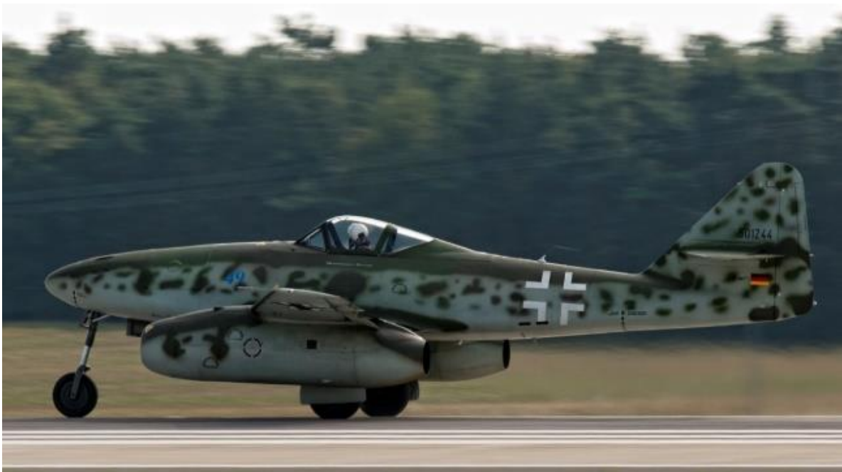
Figure 3 Fighter-bombing aircraft from World War II., Payerne, Switzerland – September 8, 2014: Messerschmitt Me 262 Luftwaffe World War II jet fighter aircraft, (dreamsteam.com).