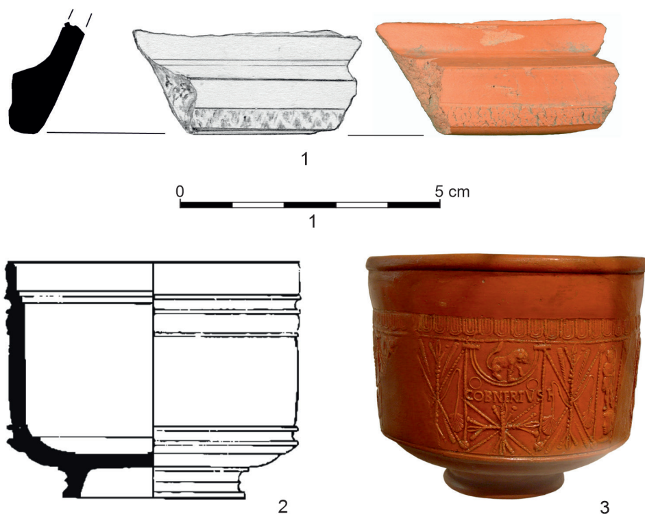
Fig. 3. 1 – Stronie, Limanowa distr., site no. 47. Fragment of the terra sigillata vessel (drawing U. Potyrała, photo K. Mazur); 2 – Drag. 30 form after H. Dragendorff; 3 – an example of a vessel of this kind from the Rheinzabern workshop, from the collections of the Museum of Saint Germain (photo C. Wszyński)

The production of terra sigillata in the Pons Aeni settlement on the Inn River in Upper Bavaria (now Pfaffenhofen am Inn, Ortsteil der Gemeinde Schechen, Landkreis Rosenheim), located close to the Westerndorf workshop (cf. Kellner 1964, 80) and the relatively wide distribution of Pfaffenhofen products appear to attest to a favorable economic situation for the production of this type of vessel during the Severan dynasty. The first detailed information on this production site is due to the separation of HELENIUS materials from Pfaffenhofen by H. J. Kellner (1964). Earlier, however, attention was drawn to the presence of the DICANUS style in terra sigillata from the Roman provinces and Central European Barbaricum (Karnitsch 1955; 1959; Rutkowski 1963). The products of these areas were originally assigned to Lauriacum (now Lorch Enns, Linz-Land district) on the Enns River in Upper Austria or the Westerndorf area. However, excavations