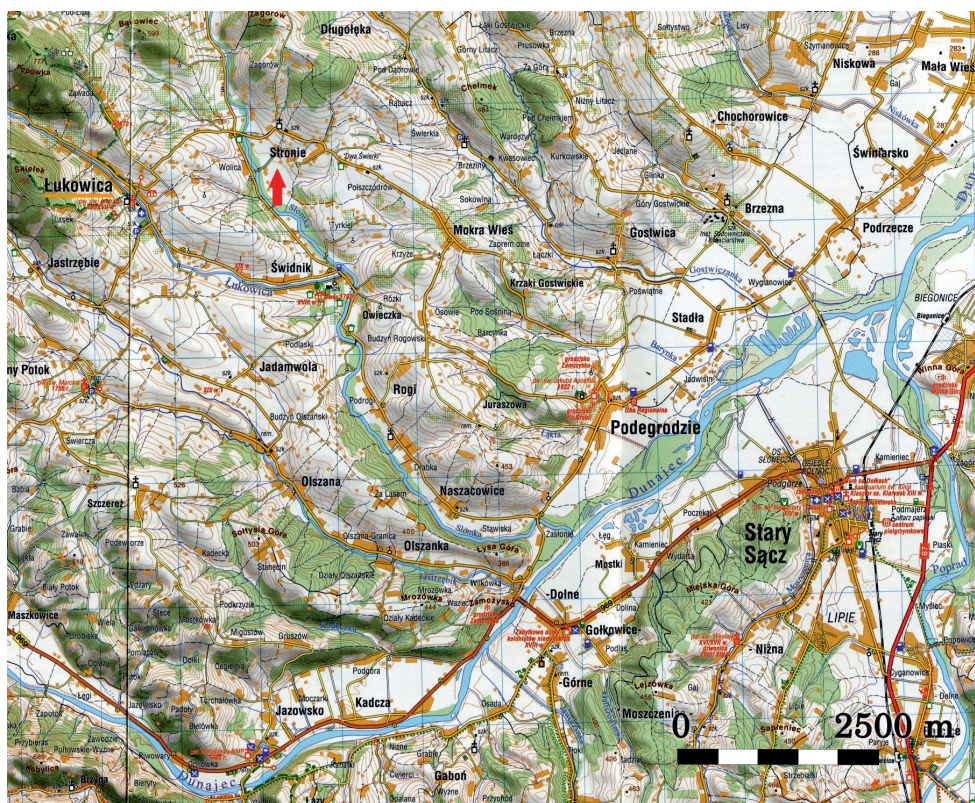
Fig. 1. Stronie, Limanowa distr. Location of the site no. 47 against the background of the part of the Sącz Basin and the Beskid Wyspowy Mountains

The state of preservation of this piece of pottery implies a settlement context, as it does not bear any traces of burning on a cremation pile, which is usually observed in the case of terra sigillata found on cemeteries of the Przeworsk culture (Fig. 3: 1).