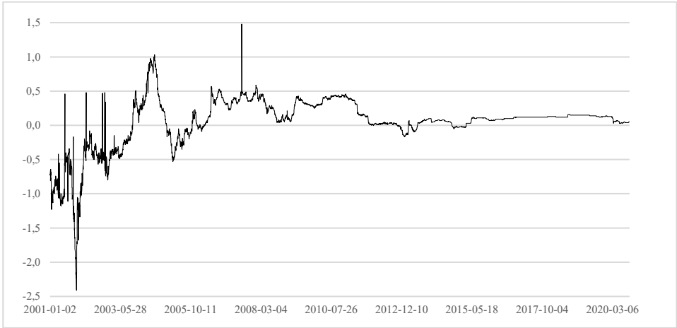
Figure 2. Differences between WIBOR 1Y and WIBOR 3M rates