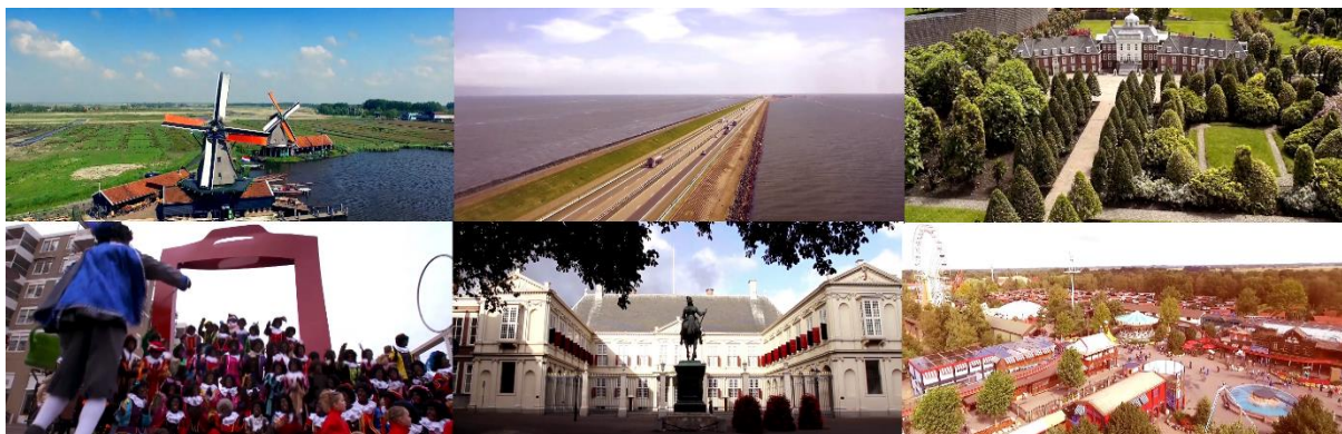
Figure 1. Dutch attractions appearing in the original America First YouTube video: Kinderdijk windmills, Afsluitdijk, Madurodam, Black Pete tradition, William of Orange statue at Noordeinde Palace, Ponypark Slagharen.

Utilising Uşaklı et al.’s (2017) typology to analyse the “America First” YouTube memes, we could see that similar themes of destination imagery appeared in these videos. Specifically, in the case of the original video “America First, the Netherlands second”, the video consists almost exclusively of major destination image themes, including some of the most iconic Dutch travel attractions: cultural (Kinderdijk windmills, Afsluitdijk, Madurodam, Black Pete tradition), historical (William of Orange statue at Noordeinde Palace) and recreational (Ponypark Slagharen) attractions (see Figure 1). Hence this clip and the other “America First” meme videos resemble typical destination marketing videos in terms of their visual content. However, the videos’ typical destination imagery is not accompanied by the stereotypical narratives of inviting the tourists to come and explore the destination. The destination imagery is meshed with humour in the form of sarcasm and political critique.