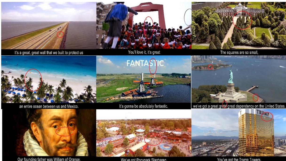
Figure 4: Eye tracking result – control group.

Note: each colour is one participant's eye movement path. Points are points of fixation. That means that the respondent remained gazing at the point. Lines show the path.