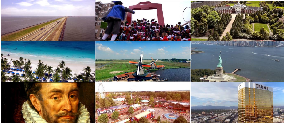
Figure 2. Pictures used for memory recall test.

Finally, we included three focus groups, first showing the participants the video and then discussing their reactions to the video in-depth. Participants for the eye-tracking research method were different than the respondents in the focus groups to prevent re-viewing. The total number of focus group participants was 38 and they were mainly young people – university students at the level of bachelor studies of tourism programmes. Their age spanned 20 to 24 years old. The first group consisted of 13 Czech students, the second group of 12 Slovenian students and the third group was a mixed international group of Slovenian, Swedish, Czech and Italian students ( n = 13 ). In the focus groups we included 10 male and 28 female students. The locations of the focus groups were the Czech Republic and Slovenia. An important limitation of this study is the convenient sample: university students. The reason for the convenience sampling technique, besides the researchers' obvious access to a student population, is the fact that the most typical YouTube users who would watch these memetic videos would be young and fluent in English, thus making the convenience sample of university students very much applicable to the issue at hand. Another limitation is the choice of the eye-tracking method because it shows only visual attention, thus we do not know much about other cognitive processes that are involved. We included the focus groups in order to reduce this limitation.