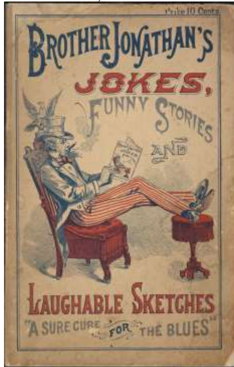
Figure 5. Books. Books. Books: Just Received.

For Australians who couldn’t get enough American jokes from newspapers, they could get books of them from overseas. A Sydney bookshop offered through a newspaper advertisement New Yarns and Funny Jokes: Illustrated American Humor as well as the following in Figure 5 (‘Books. Books. Books: Just Received’ 1893).