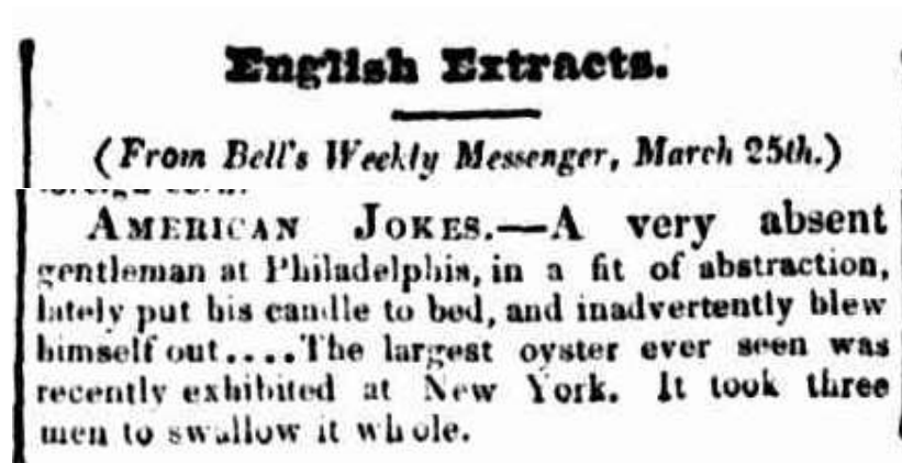
Figure 2. English Extracts.

Sometimes, “American Jokes” arrived in Australia via English journals, such as that in Figure 2 (‘English Extracts’ 1838):