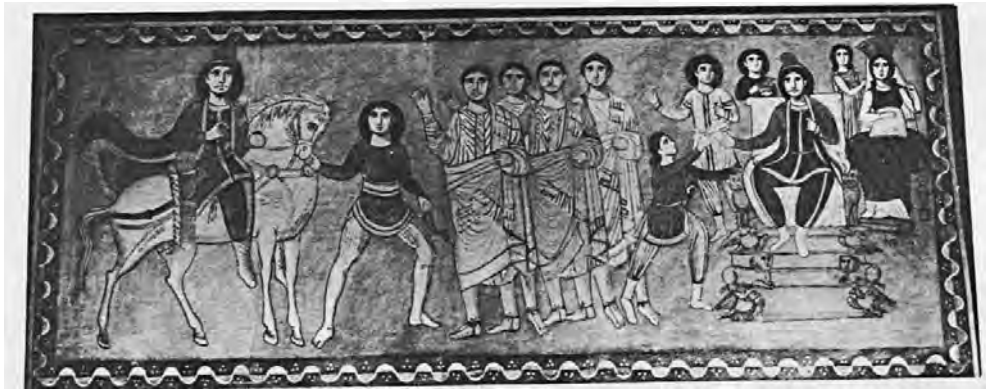
Purim panel, after Gutman 1992

More important is the following inscription (Geiger 1956: no. 44) which is placed on the panel scene associated with the story of Purim: