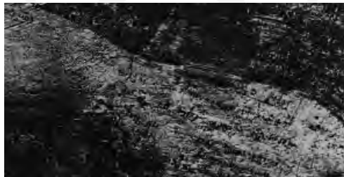
After Geiger 1956, pl. XLIV