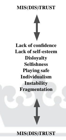
Figure 2. The dynamics of mis(dis)trust