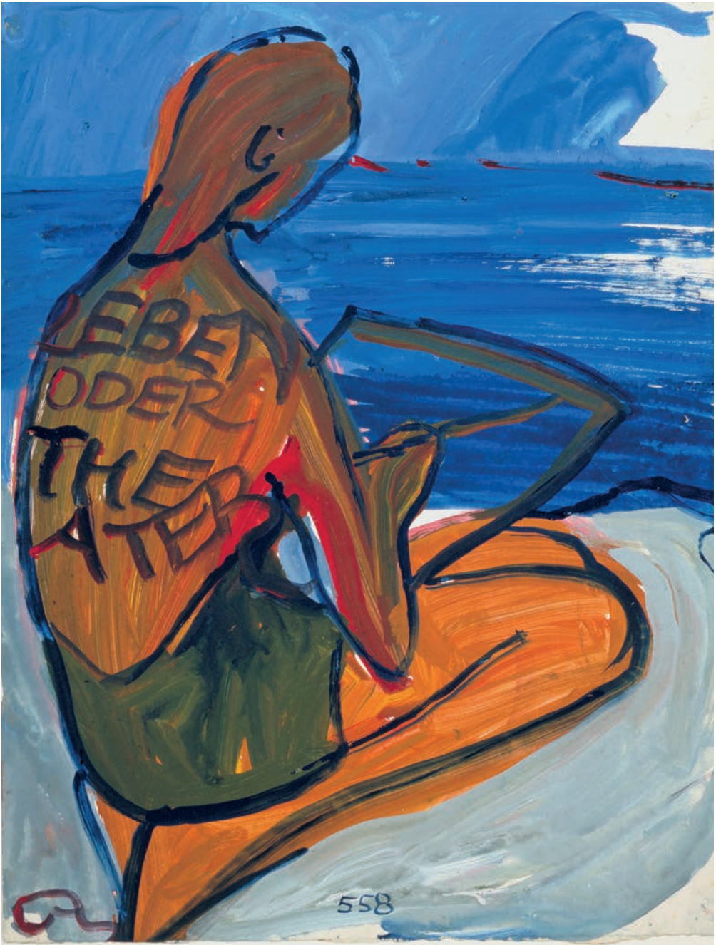
Fig. 1. CS [Charlotte Salomon], The Final Painting: CS Beginning to Paint (painting no. 558, JHM 4925). Leben? oder Theater? , 1941–42, gouache on paper, 25 x 32.5 cm. Jewish Historical Museum/Charlotte Salomon Foundation, Amsterdam.