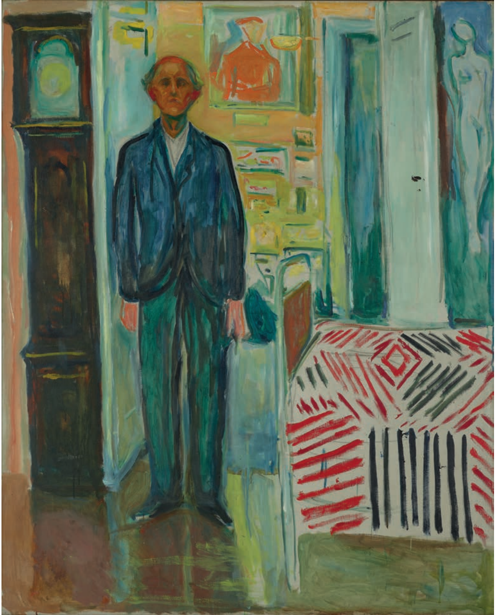
Fig. 8. Edvard Munch, Self-Portrait between the Clock and the Bed , 1940–43, oil on canvas, 120.5 x 149.5 cm. Munch Museum, Oslo.