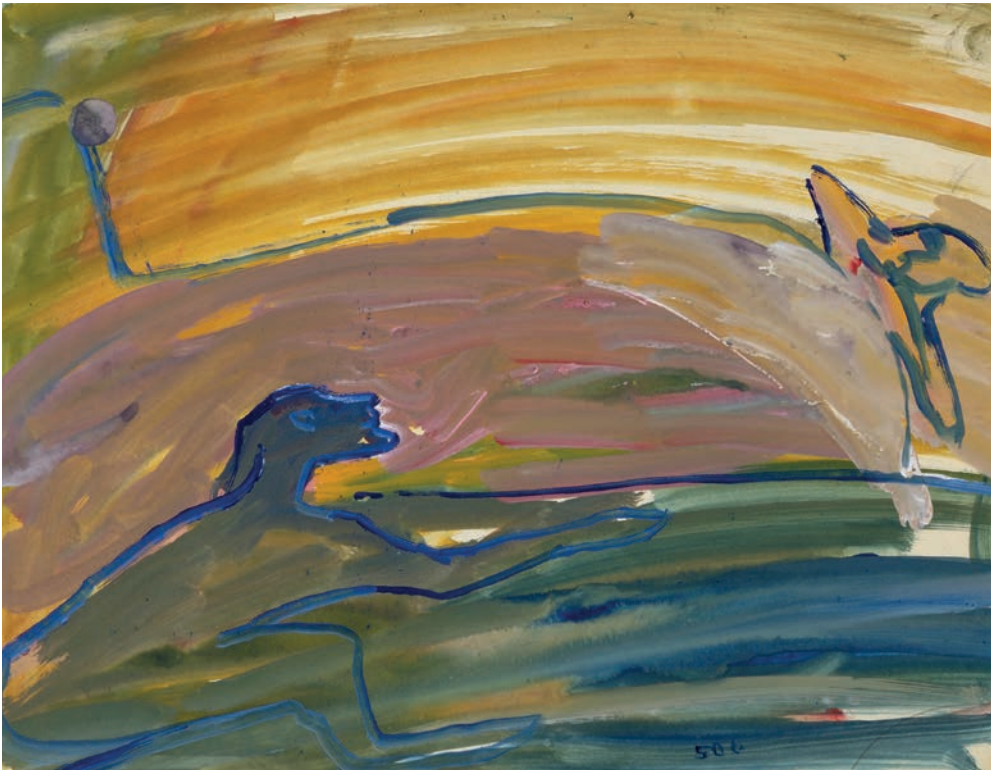
Fig. 6. CS [Charlotte Salomon], The Night Struggle (epilogue painting, no. 506, JHM 4884), Leben? oder Theater? , 1941–42, gouache on paper, 25 x 32.5 cm. Jewish Historical Museum/Charlotte Salomon Foundation, Amsterdam.