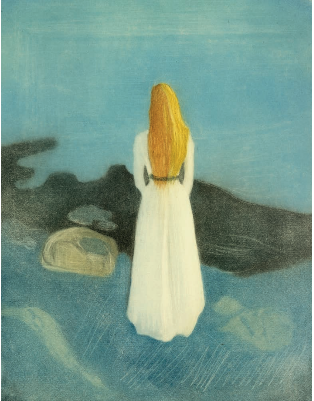
Fig. 2. Edvard Munch, Young Girl on a Jetty , 1896, coloured etching and scraped aquatint, 219 x 288 cm. Munch Museum, Oslo.