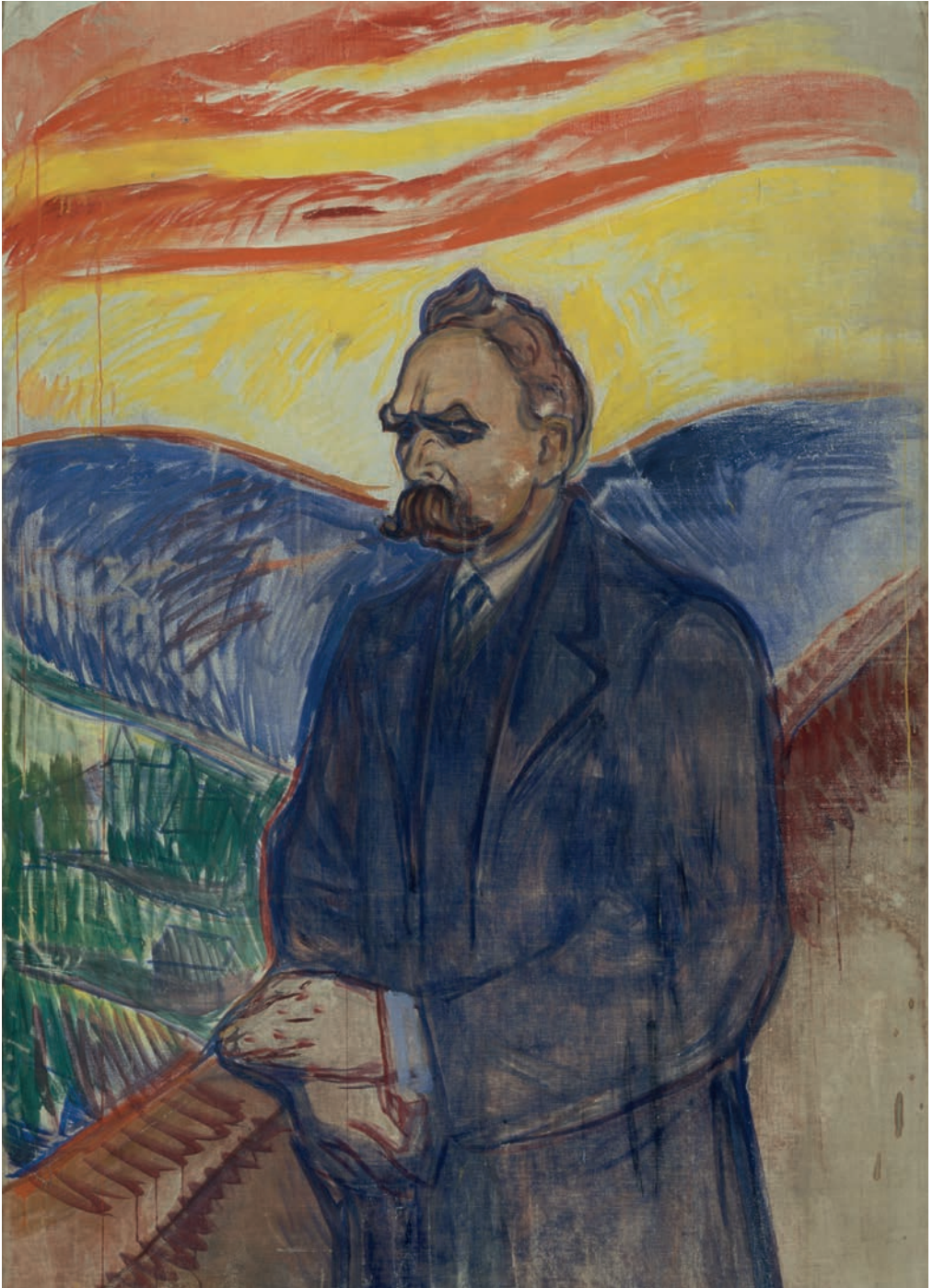
Fig. 7. Edvard Munch, Portrait of German Philosopher Friedrich Nietzsche , 1906, oil on canvas, 201 x 160 cm. Munch Museum, Oslo.