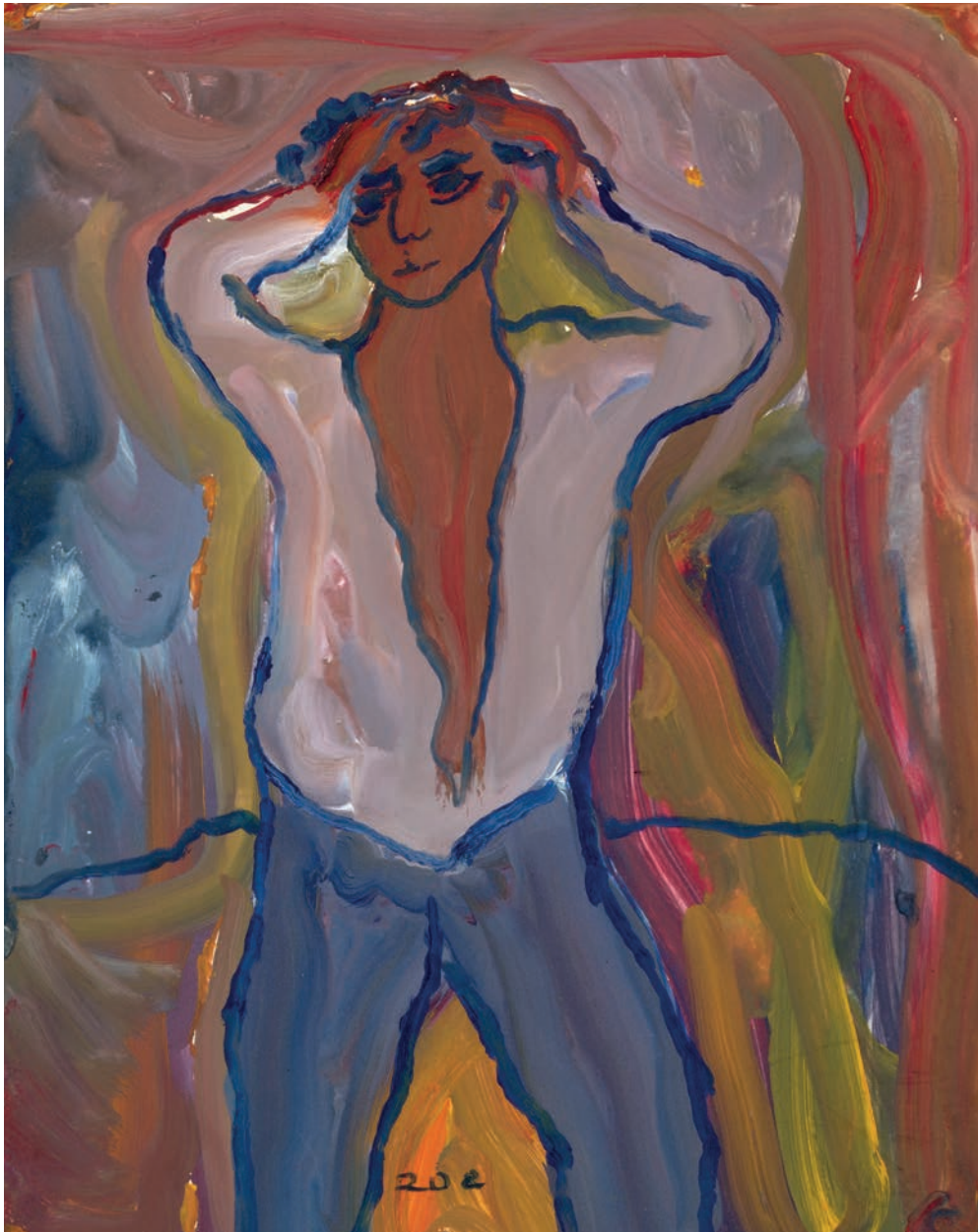
Fig. 3. CS [Charlotte Salomon], Amadeus Daberlohn after Listening to Paulinka Bimbam Singing Gluck (main part painting, no. 208, JHM 4587), Leben? oder Theater? , 1941–42, gouache on paper, 25 x 32.5 cm. Jewish Historical Museum/Charlotte Salomon Foundation, Amsterdam. The overlay says: “The blood courses hotly through his veins.”