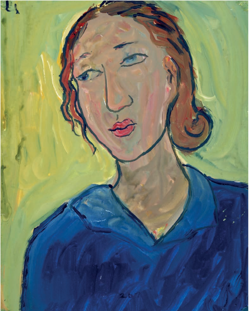
Fig. 5. CS [Charlotte Salomon], Jealous Charlotte (main part painting, no. 261, JHM 4639), Leben? oder Theater? , 1941–42, gouache on paper, 25 x 32.5 cm. Jewish Historical Museum/Charlotte Salomon Foundation, Amsterdam. The overlay says: “Charlotte is not sure of her emotions. Is it jealousy or something else growing within her where her love is concerned?”