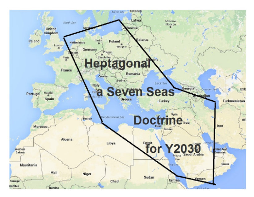
Map 1. A zone of "Seven Seas - HEPTAGONAL", prepared by author