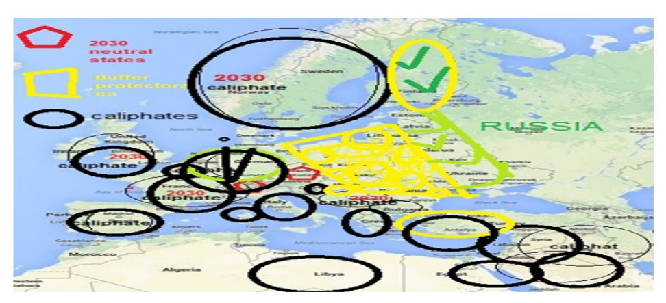
Map 4. The European Geo-Political 2030 scenario, prepared by author

A blurred strategical year 2030 picture of a zone of "Seven Seas – HEPTAGONAL" , (see Map 4) with weak energy transfer security may generate the next Eurasian conflicts, where Balkan and European countries will implode, creating new military zones of instability, with unsustainable confrontations of gloomy migrants trying to escape problematic war regions and military or terrorist acts.