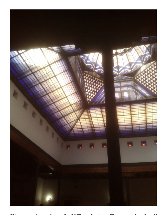
Picture 1 – A roof of "Fundación Euroárabe de Altos Estudios", Granada, Spain

As we expect, a great Islamic war in the Middle East will export regional wars and influence around. In the Balkans the present geopolitical games will become outdated. They are mostly Orthodox Christian countries supported by Russia's (and partly China's) West Balkans Strategies (with Serbia, Kosovo, Montenegro, Macedonia Moldova, Transdnistria buffer zones). These nations, and their ethnically motivated conflicts and challenges provide many points of tension.