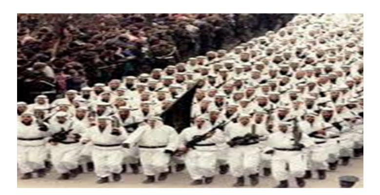
Picture 2, Source: https://islamicpersecution.wordpress.com/tag/radical-islam-in-bosnia

of oil and gas pipelines or infrastructure projects. As we said, in the 2030s decade could see regional wars spread under various unpredictable scenarios<sup>16</sup>. We will briefly draw our 2030s scenario for Balkan part of "Seven Seas Zone - HEPTAGONAL". The line of fire on Balkan may this way around year 2030 create two or three smaller regional caliphates orbiting around Islamic states in the Middle East.